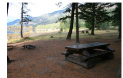
Part of one of the Forestry campsites at Fountain Lake

"I'm excited to be a part of the XCEDP team and look forward to hearing your thoughts on Economic Development"