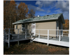
Concession building at Fountain Lake. Part of the Forestry Camp sites project.

I anticipate the day Xaxli'p can begin the process of becoming self-sufficient and a valuable employer to people for meaningful employment in a broad range of sectors.