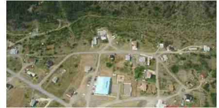
AERIAL PICTURE OF XAXLI'P, MAIN RESERVE

I am eager to hear your thoughts and your input towards economic development. I look forward to assisting the team in producing the 5 Year Strategic Community Economic Development Plan for Xaxli'p.