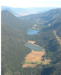
AERIAL VIEW OF FOUNTAIN VALLEY

Our consultation methods will include contact through telephone, email, Open House, door to door