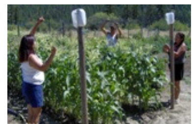
XAXLI'P COMMUNITY GARDEN

ECONOMIC DEVELOPMENT IS A POLICY IN PRACTICE & A GOAL IN PROCESS, YET THERE IS NO END POINT